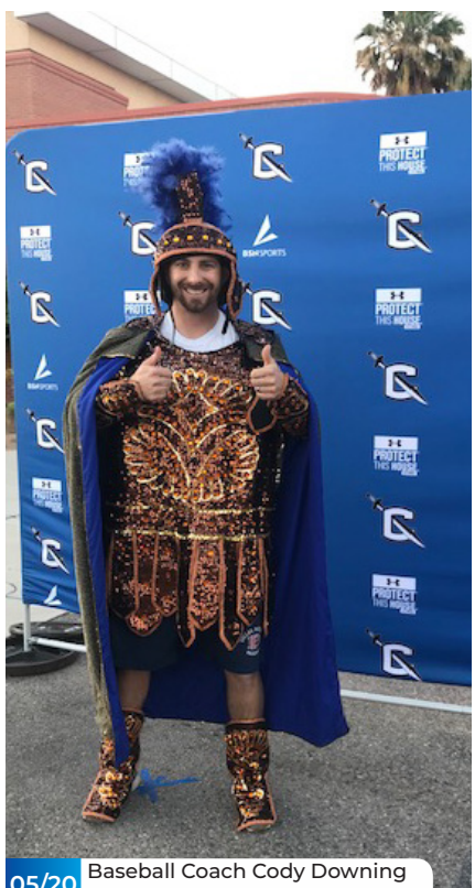
posed as CHS Trojan with grads

Just two months later, after playing only a handful of games, the Coronavirus Pandemic struck. We had only just started our season, and it was suddenly over, before we had even got to spring break. My heart was broken for our seniors. Looking back on our extremely short season, one main memory stands out: "the break-in." While I am still heartbroken for my boys, there is a silver lining. Thanks to the community rallying around us, this season still holds value. We learned an important lesson about helping others in need. Despite our season being cut short, we are still grateful to have learned this great life lessons, and I am hopeful that my boys can look back at this year