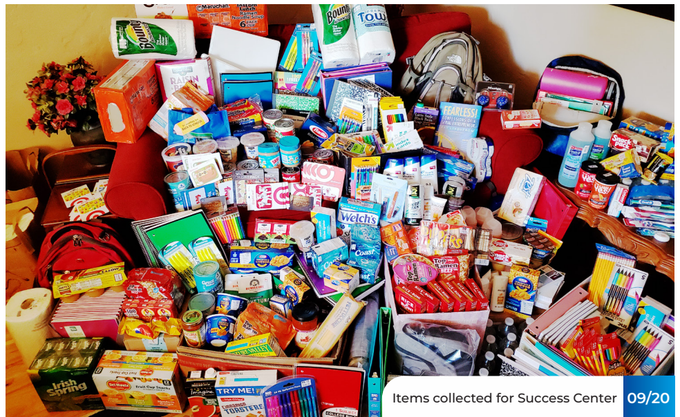
Items collected for Success Center 09/20

In mid-September, members of the Tucson Delta Gamma Alumnae provided manpower to deliver the boxes and boxes of donations to the school. Their members had made this challenge the focus of their annual "DO GOOD" project, and many, many of the donations were from their members. The contributions included more than