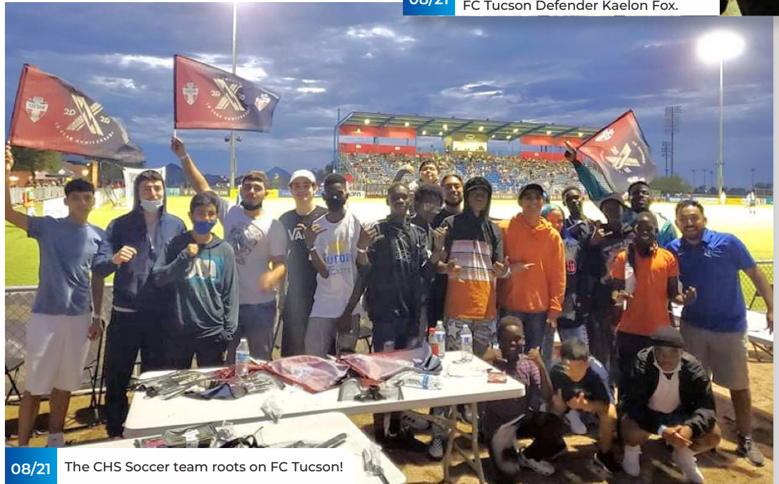
08/21 The CHS Soccer team roots on FC Tucson!