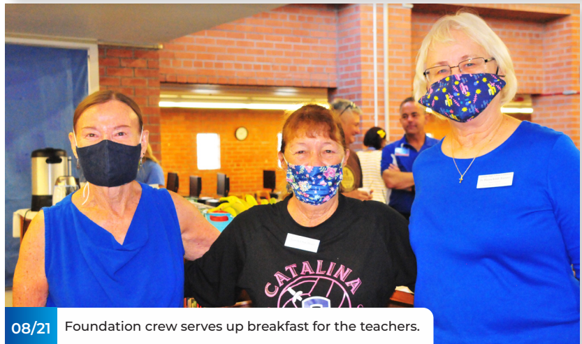
08/21 Foundation crew serves up breakfast for the teachers.