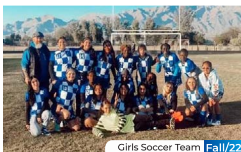
Girls Soccer Team Fall/22