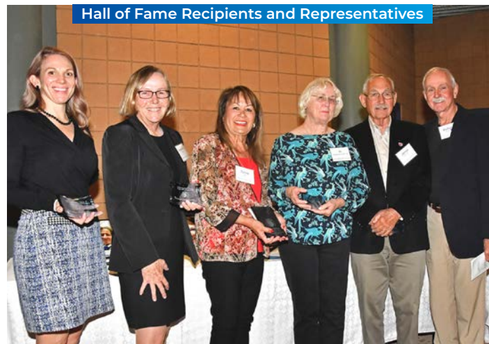
Hall of Fame Recipients and Representatives

It's an annual event...not to be missed. This year's theme was "Planting Seeds for Success", and participants were each given a packet of sunflower seeds to plant at home. Mark your calendar—