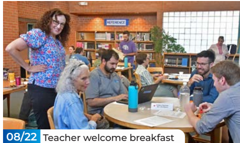
08/22 Teacher welcome breakfast