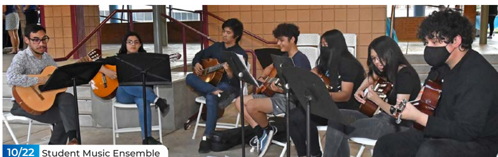
10/22 Student Music Ensemble

October 19th is the date for the next Social. The following weekend provides a great weekend to hold a class Reunion, so classmates who have not been back can come to town early and participate! See you October 19, 2023!