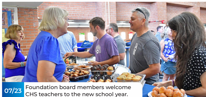
07/23 Foundation board members welcome CHS teachers to the new school year.

Board members showed up bright and early to set out the food and refreshments in Catalina’s library, which looks spiffy with new furniture, including chairs and couches in CHS blue. The Foundation welcomed and thanked the educators, explained its mission and let them know how they can apply for grant funding.