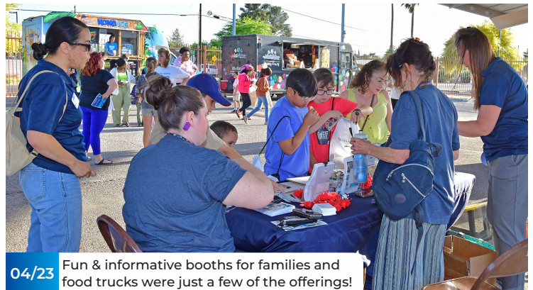
04/23 Fun & informative booths for families and food trucks were just a few of the offerings!

The CHS Foundation's support of this event was much appreciated, as was expressed to those of you who were in attendance. Thank you for taking a chance on this first annual event. We hope that next year we can put it on again.