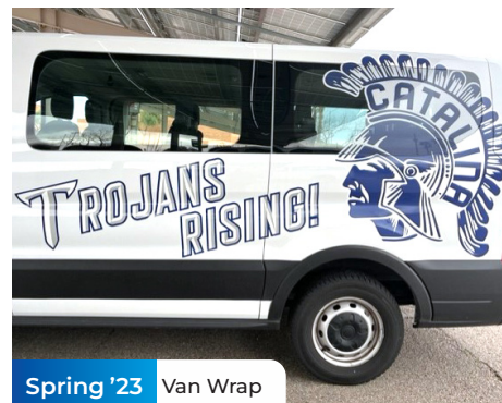
Spring '23 Van Wrap

He notes that many Catalina students face challenging economic and family situations. As student-athletes they may need help finding that balance between competing, learning and living. “There’s