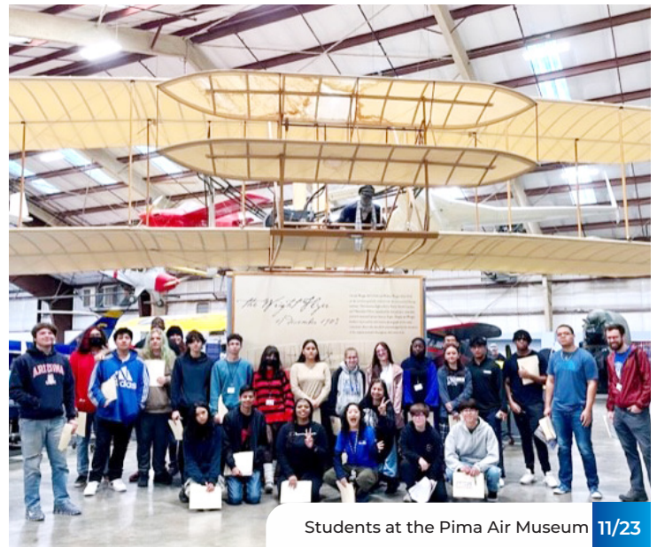
Students at the Pima Air Museum 11/23

At the Museum, a representative highlighted significant historical events and individuals. Students also learned about the Tuskegee Airmen, their contributions to aviation history, and the challenges they faced as African American pilots during World War II. The Museum also