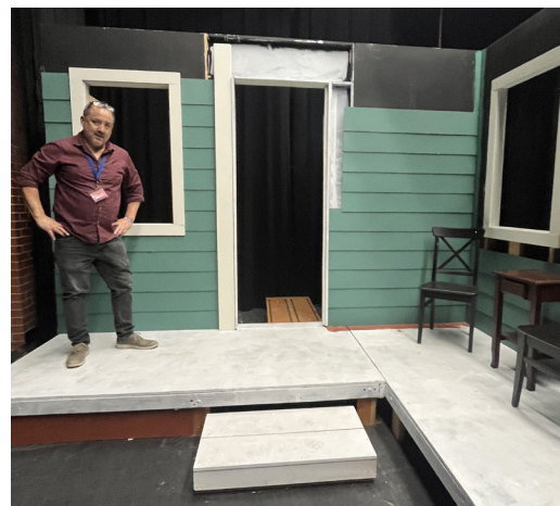
Porch set funded by the Foundation is almost done!

Matthew Lai, $440 , which includes $340 to purchase performance rights to the play and a mandatory