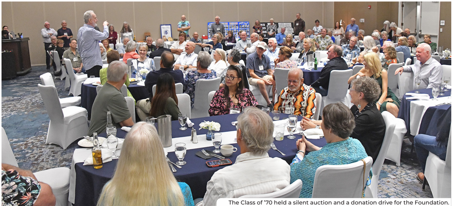
The Class of '70 held a silent auction and a donation drive for the Foundation.